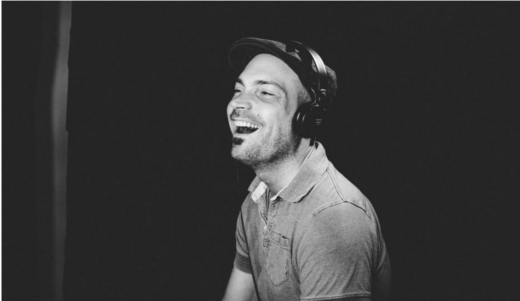
ROGER CICERO, Recording in 2015